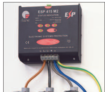
Live connecting leads should be fused accordingly

Install in parallel, within the power distribution board, either on the load side of the incoming isolator, or on the closest outgoing way to the incoming supply.