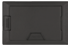
03 &amp; 04

Metallic floor box covers are designed for use with 664 series concealed floor boxes.